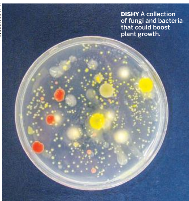
DISHY A collection of fungi and bacteria that could boost plant growth.